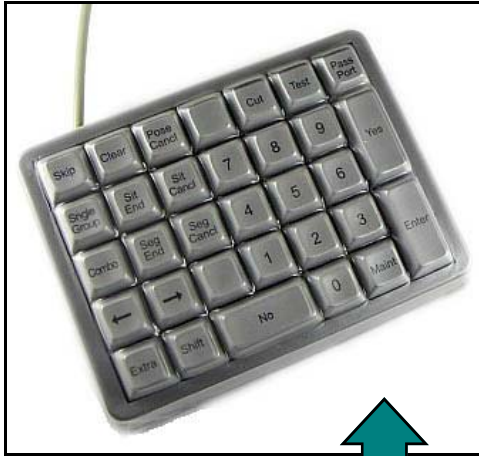
Model 682 w/custom printed keys

Example of how the keypad can look with custom printed keycaps.